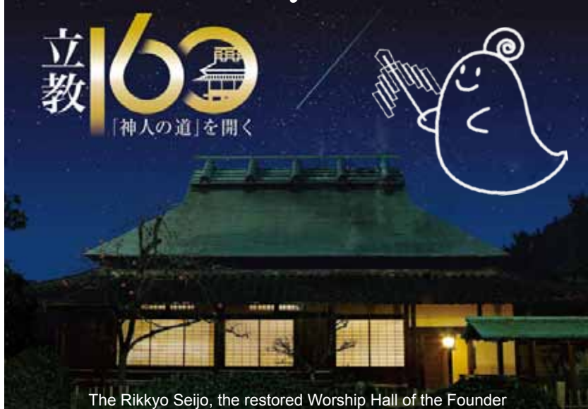
The Rikkyo Seijo, the restored Worship Hall of the Founder

K onko Daijin received the Divine Call when he was 46. The Divine Call started with the following words: