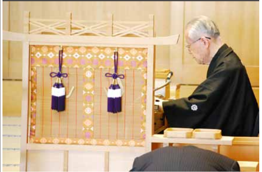
The Fifth Konko-Sama