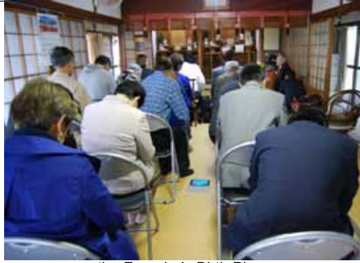
the Founder's Birth Place