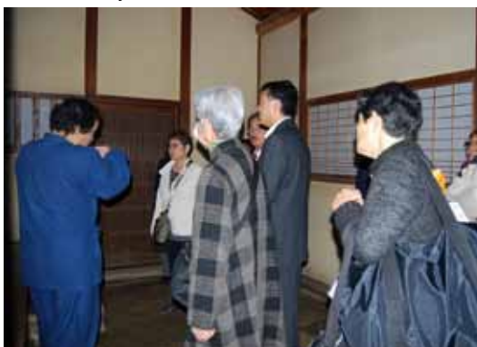
The Founder's Mediation Hall

vine Arrangements ahead of time, the outcome depends upon what people do, how they do things, and what direction their hearts are facing.