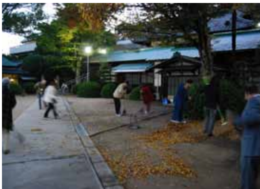
Saiso Sacred Cleaning