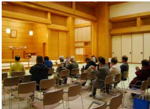
Prayer at the Main Worship Hall