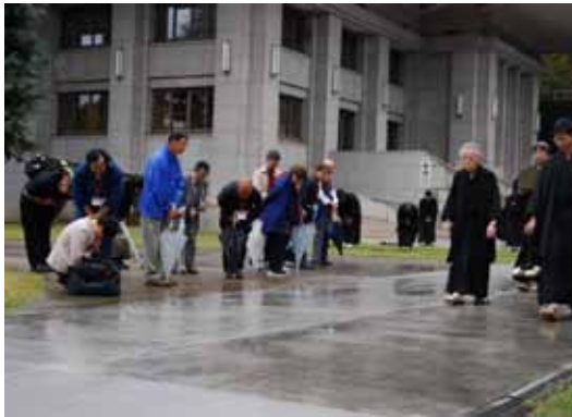
Konko-Sama's Procession from the Main Worship Hall.