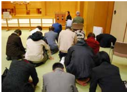
Toritsugi Madiation at the Main Worship Hall

Our Founder was faced with the difficult task of digging seven graves. At the age of 42, after experiencing seven deaths, he became gravely ill. The doctors gave up all hope for his recovery. In this situation, he was able to hear Kami's message, which was, "In the past, Bunji (the Founder) committed irreverences to Kami during the construction on his new house." The Founder's father-in-law then protested, saying, "Bunji checked the 'Directions' prior to construction." However, Kami responded, "If you insist that Bunji checked the directions and did not offend Kami,