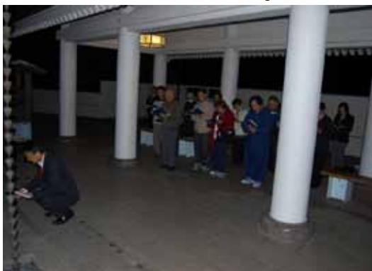
Prayer at the Founder's Grave Site