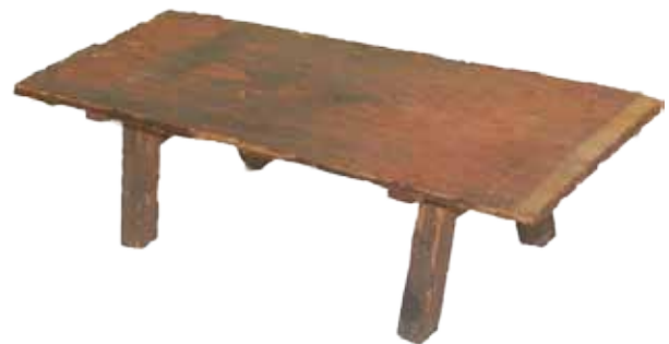
The Founder's Worship Hall desk

The Konkokyo Organization is currently planning to publish a cartoon book about the life of our Founder to commemorate the 200th anniversary of Konko Daijin's birth. We will rewrite the cartoon series of Konko Daijin, which we already published on a regular basis in the Konko Shimbun newspaper. This cartoon book of Konko Daijin illustrates