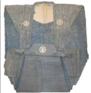
Founder's Kami-shimo , formal wear