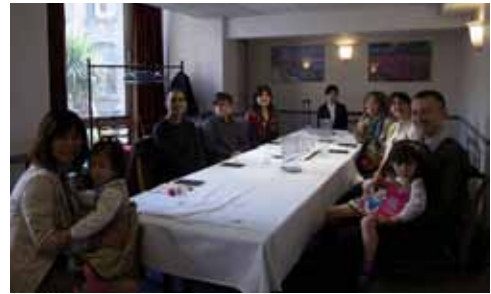
Prayer Service & Casual Discussion

Date: November 21 st & 22 nd Location: Imperial Hotel, London