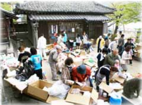
Distributing relief supplies