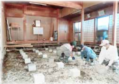
Ishinomaki Church restoration work