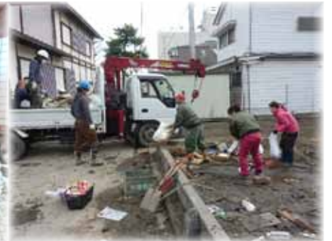
Clearing the debris

A variety of groups among Konkokyo believers are conducting support activities in the affected areas. Among them is the Konkokyo Tokyo Metropolitan Supporting Organization for Volunteers of Disaster, which is an organization consisting of the Konkokyo Tokyo Metropolitan Forum, the Konkokyo Tokyo Center and the Konkokyo Tokyo Churches Association. With Kesenuma City, Miyagi Prefecture, as its acting center, the Organization will work until the end of this year. The Konkokyo Youth Association will continue its support activities for one year with its base