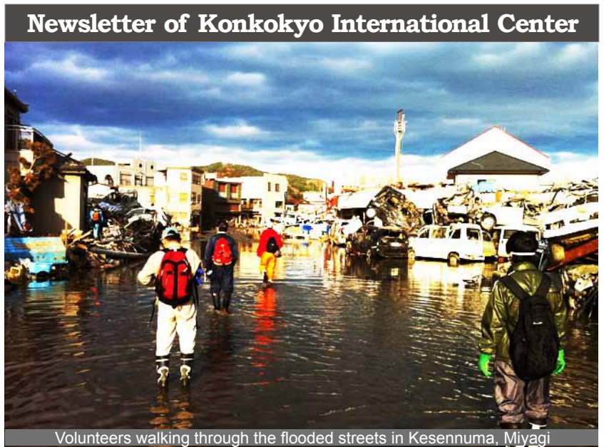
Volunteers walking through the flooded streets in Kesenuma, Miyagi