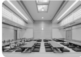
Yatsunami Hall, conference room