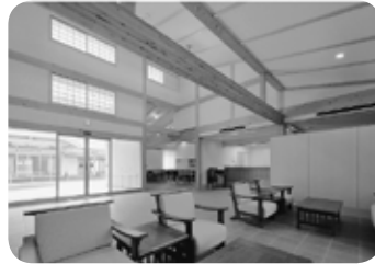
Kofukan entrance hall