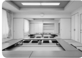
Kofukan training room