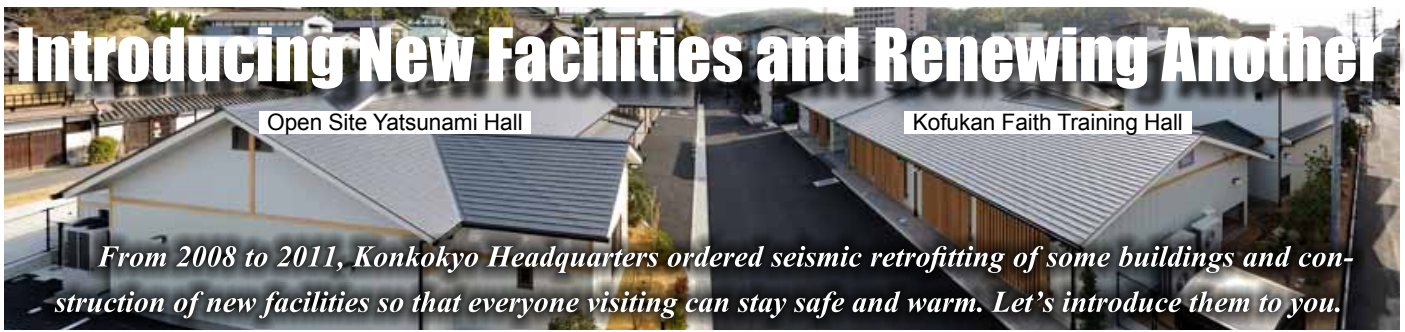
Open Site Yatsunami Hall