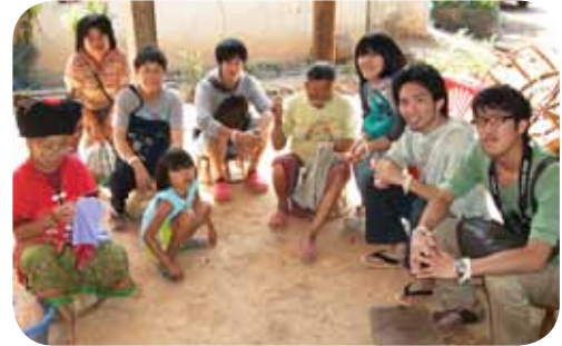
Participants with Yao villagers

Young participants who joined the study-tour for the first time opened their eyes to a new world said, "I felt that people could live because of the others supporting them" and "I am so glad to have this relationship with these people. I would like to link with others and become helpful to them."