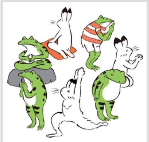
Let's make time to turn our hearts to Kami-Sama every day!