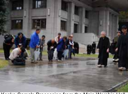
Konko-Sama's Procession from the Main Worship Hall.