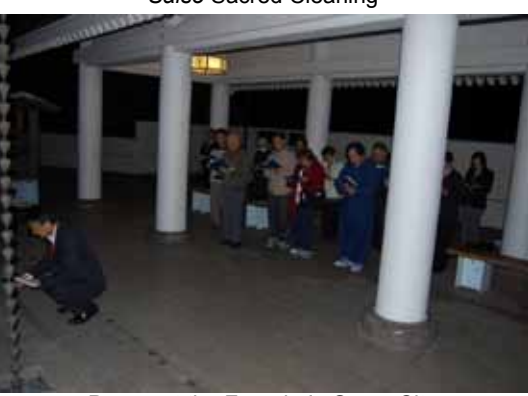
Prayer at the Founder's Grave Site