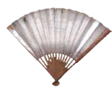
Founder's Chukei, ceremonial fan