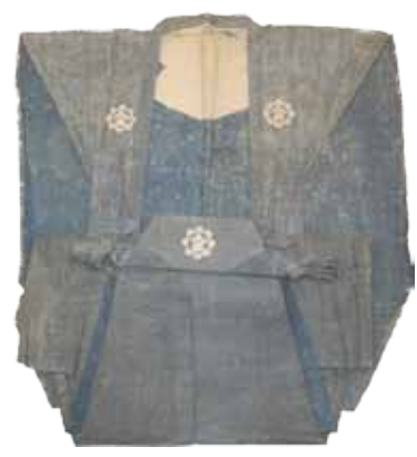
Founder's Kami-shimo, formal wear